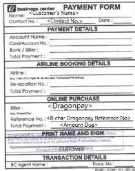
Sample Form – Robinsons Business Center