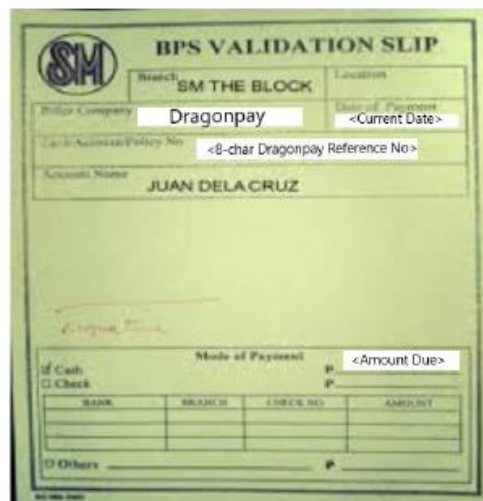
Sample Form – SM Department Store

+63917 563 8965 | +63917 816 8781 (632) 7 750 0461 marcom@now-corp.com now-corp.com